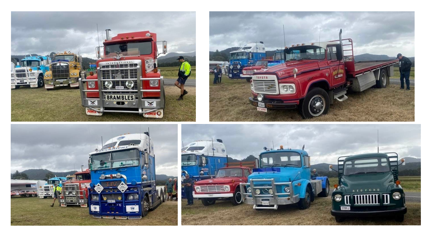
"The struggle you're in today is developing the strength you need tomorrow" Robert Tew ^{-2}

Club run to Milbrodale's Truck Drivers Memorial was a good day for a run up the Putty Road, apart for three 'Stop & Go' sites for road works. The actual road surface is in great shape after all the rain and, it's the best it's been for years with a lot of resurfacing been done. Crowd numbers were down. The placing of the new names on the wall was piped in by the piper in his kilt. Three WSHTC club members ran a 50/50 raising a total $1036, with $518 going to the drivers wall committee & the other half went to Jamie. An auction was also run raising another $150 for the committee. The weather held off until packup time then the umbrellas & hoodies were out. Overall it was a good & mostly enjoyable day and was rounded off with a dinner at a club in Singleton at night.